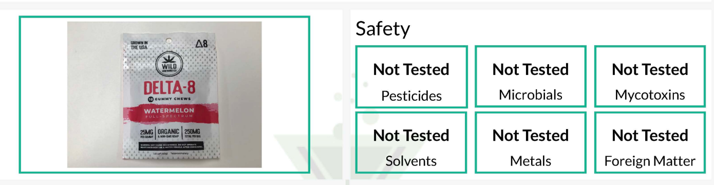
Cannabinoids Cannabinoid potency by HPLC-UV, CANSOP001 Date Tested: 04/07/2021

Harvest Process Lot: ; METRC Batch: ; METRC Sample: